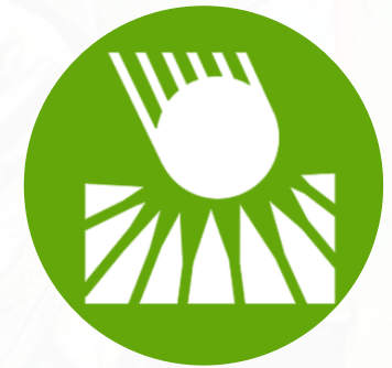
POTENTIAL IMPACT ON MANUFACTURER