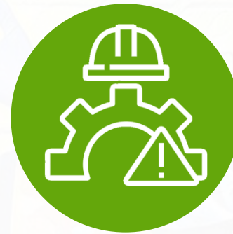
MANUFACTURING PROBLEM OR NEED