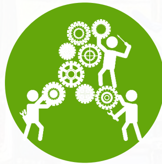
UNIVERSITY- MANUFACTURER TEAM